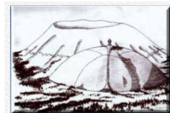
The New Gwitchen Colony on Volcano Island have constructed the Krystal Dome, named Beautiful

As more generations of Gwitchen went by, one day the Gwitchen Council of Elders listened to words from the birds that the last of the white clan peacemakers was entombed in a cavern on Volcano Island far to the south. The Gwitchen could not believe their ears and so they began the “Second Gwitchen Journey” to find this last peacemaker. And, they did.